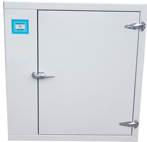
Model Shown - LCI/425V/TDIG

The Genlab range of Large Capacity Incubators offers a selection of highly efficient, reliable and cost effective units. They are suitable for larger applications of incubation, research and general laboratory applications. Featuring our latest touch screen control system which offers intuitive control and excellent accuracies designed for laboratory incubators.